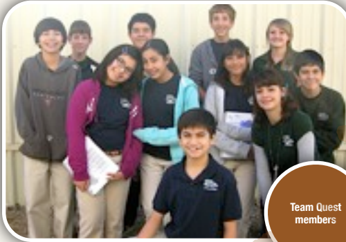
Team Quest members