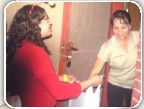
Trick or can

NJHS is still collecting aluminum tabs for the Ronald McDonald house fund. A student who turns in one zip lock sandwich sized bag full of tabs is rewarded with one hour of