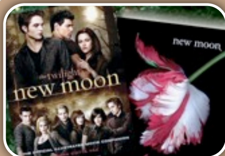
Eighth graders attended premier of New Moon