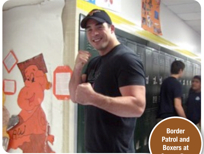
Border Patrol and Boxers at Career Day